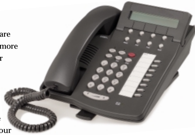
The 6408D+ is an entry-level feature/function telephone.

Most models also have flexible feature buttons and four “navigator” keys indicating Menu , Next , Previous , and Exit , as